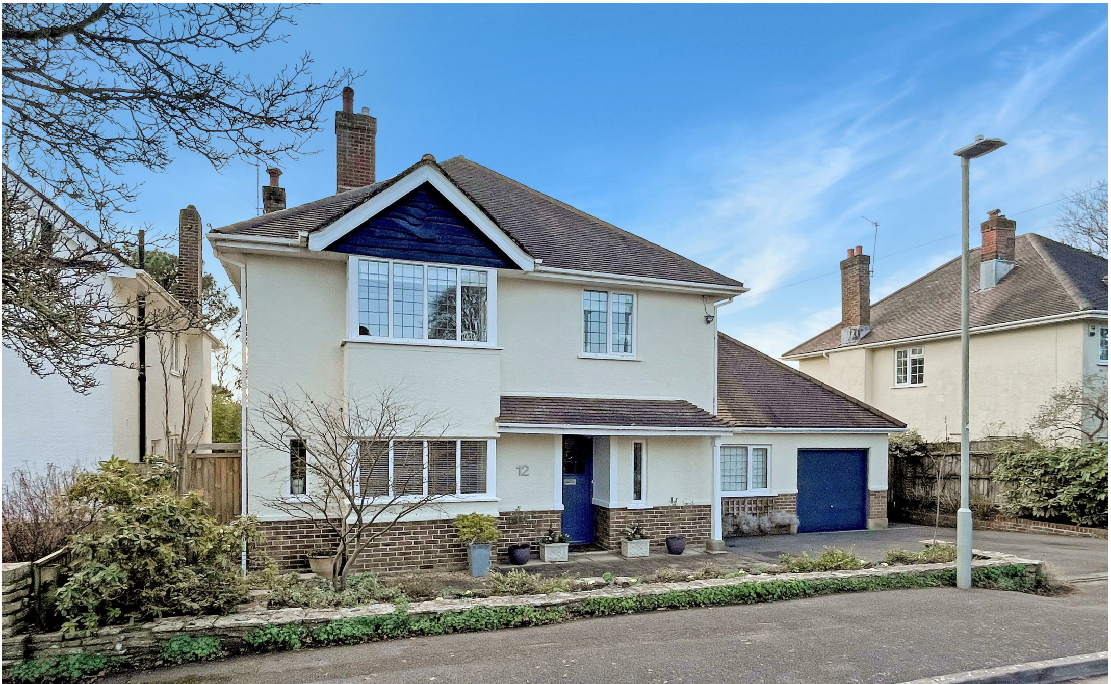
12 Frankland Crescent, Lower Parkstone, Poole BH14 9PX £1,175,000 Freehold